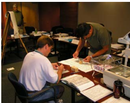
Gage R&R Exercise

The Tennessee Agricultural Experiment Station conducts mission oriented research programs to serve Tennessee agriculture and forestry producers. The Center is an outgrowth of the Governor's Council on Agriculture and Forestry, convened in May 1996. The Center is the only such full-time research facility among U.S. university programs. Undergraduate and graduate students are included in the research programming of the Center and gain valuable experience in conducting research.