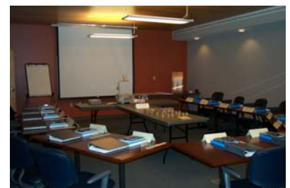
Modern Training Facility and Small Class Size