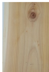
Western redcedar — a naturally durable wood

Some tree species grow wood that is naturally resistant to attack by insects and fungi. This durability is due to chemicals deposited in some parts of the tree (the heartwood) as it grows. Redwood, cypress and cedar are examples of species with naturally durable wood. It is important to note that only the heartwood (the inner-core wood from the living tree) is durable; the sapwood of all species is susceptible to rot and insect attack. The heartwood in most naturally durable species is darker in color than the sapwood, which is generally white or tan.