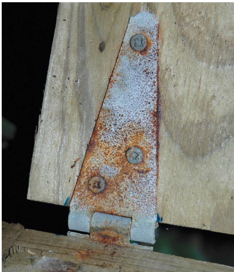
Corrosion of galvanized steel hinge attached to ACQ-treated wood. New preservative formulations can be very corrosive to metal. It is important to use the recommended fasteners when building a deck.

Special corrosion resistant fasteners should be used with all decking materials. These include galvanized, ceramic coated or stainless steel screws and nails. The new preservative formulations are very corrosive to some metals, so it is especially important to use suitable fasteners with treated wood. However, durable fasteners are also important when installing naturally durable wood or WPC lumber to avoid rusting and discoloration.