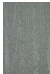
An example of wood/plastic composite decking

WPC material is a combination of wood flour (or other natural materials such as rice husks) and plastic shaped into decking lumber. WPC lumber is a relatively new product and is often better known by its various brand names: e.g. Trex, ChoiceDek, Eon or SmartDeck – or as composite lumber. Lumber made entirely from plastic with no wood flour added – plastic lumber – is also available but is not as commonly used for decking projects. WPC lumber can be manufactured in a variety of colors, shapes and sizes and with different surface textures.