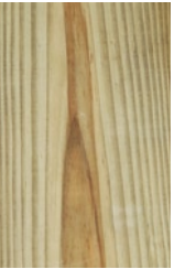
Preservative-treated Southern pine

Preservative chemicals can be added to otherwise susceptible wood to make it resistant to decay fungi (rot) and insects. Wood protection is achieved by forcing chemicals deep into wood using a combination of vacuum and pressure. Pine is often used for this in the southern United States because it is strong, inexpensive and is usually well penetrated by the chemical solutions. The