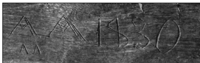
Fig. 1. Carving in one log of the cantilever barn, stating (likely) "A A 1830."

The barn presented a unique challenge because it consisted of two separate structures (called "pens"), each with four walls that extended for two floors, but also consisted of accessible logs that were part of individual rooms and separate walls in the lower portion of the barn. Cores extracted from the barn were labeled either "NP" (North Pen) or "SP" (South Pen), followed by cardinal direction, whether the log was located in the lower ("L") or upper