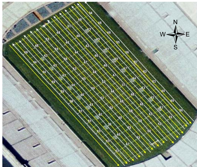
Figure 3. Survey transects and travel directions taken by the mobile GPR system, crossing over locations of labeled CIST IV data points.

Figure 4 illustrates CIST IV point data that are spatially interpolated (Krigging) and overlaid onto an aerial photograph of a collegiate football stadium (University of Tennessee Neyland Stadium, Shields-Watkins Field, Knoxville, Tenn.) Higher IV values follow both mid-field sidelines, the most prominent being the home team sideline along the northeastern boundary.