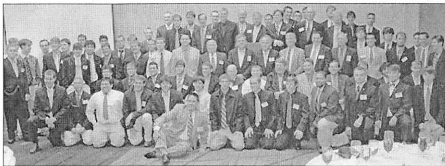
Nearly 100 alumni and active members attended the 86th annual Founder's Day celebration

The weekend events included a Friday night celebration at Calhoun's on the River and a Saturday morning golf tournament. The Founder's Day festivities highlighted the weekend on Saturday evening at the Knoxville Convention Center. The evening